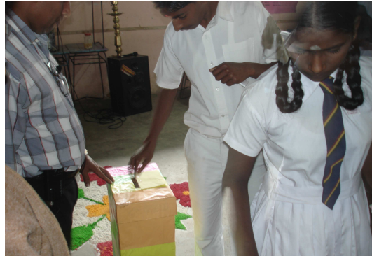
the age their selected