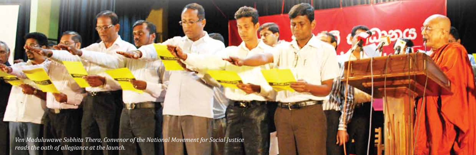
Ven Maduluwawe Sobhita Thera, Convenor of the National Movement for Social Justice reads the oath of allegiance at the launch.