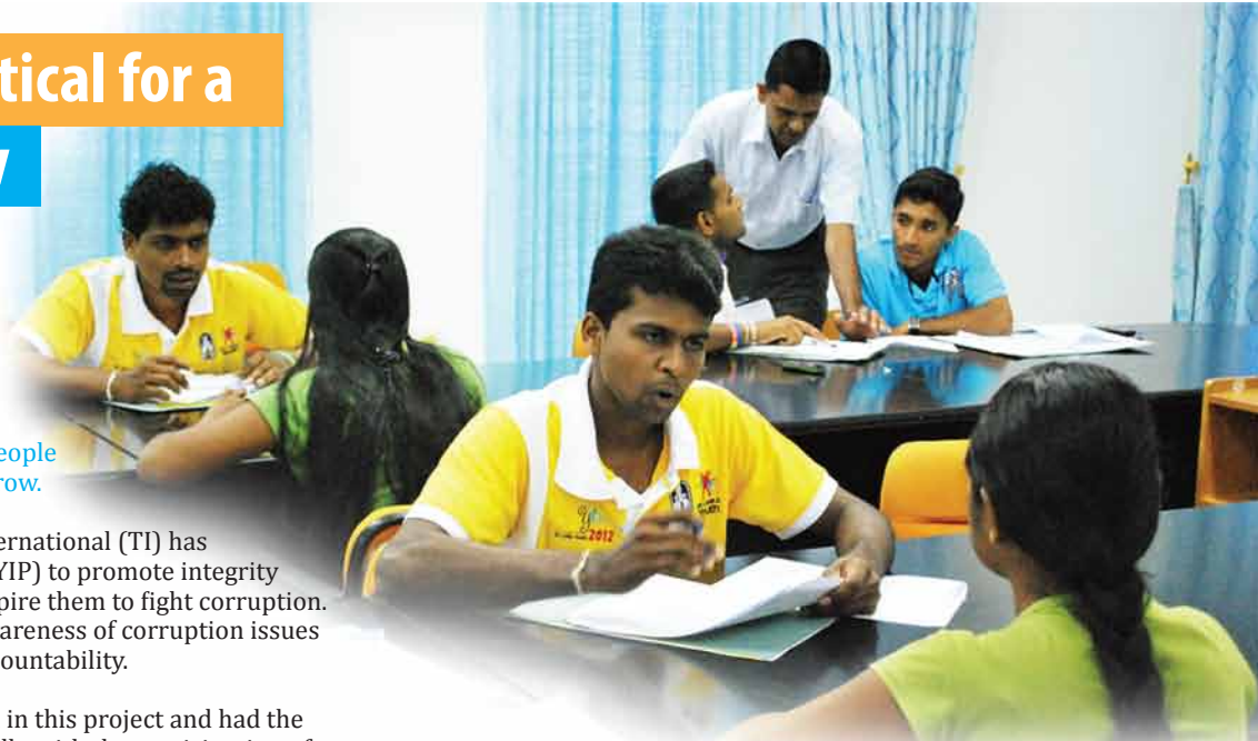
Getting ready for the survey - enumerators are briefed

Representatives from TI chapters in Fiji, Indonesia, Korea, Sri Lanka and Vietnam, and the Centre for Development Studies in Vietnam met in Negombo for the regional launch of the Project at a simple ceremony followed by a two-day workshop. Country representative of the World Bank and the National Youth Services Council (NYSC) officials also attended the ceremony.